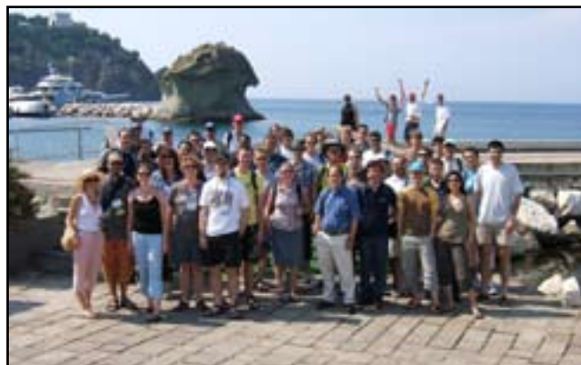
Students at the Fourth International Grid Summer School, held in Ischia, near Naples, Italy

This summer sixty-five students from 17 different countries traveled to the beautiful Island of Ischia, near Naples. Throughout two weeks, they took part in an intensive programme designed by an international committee to give them an in-depth introduction to Grid technologies and applications.