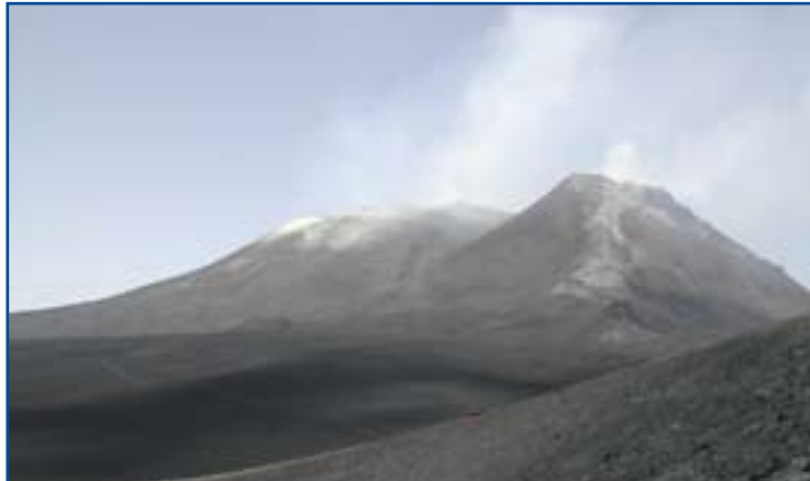
Mount Etna, Sicily, Europe's largest active volcano

Predicting eruptions will become easier now scientists are using technology to translate the patterns of a volcano's behaviour into sound waves. EGEE, in collaboration with the EELA (E-Infrastructure shared between Europe and Latin America) project, who are already investigating volcano sonification at Mount Etna, Sicily, are using the GÉANT2 and ALICE-RedCLARA networks to further extend this important study to include Ecuador's Tungurahua volcano.