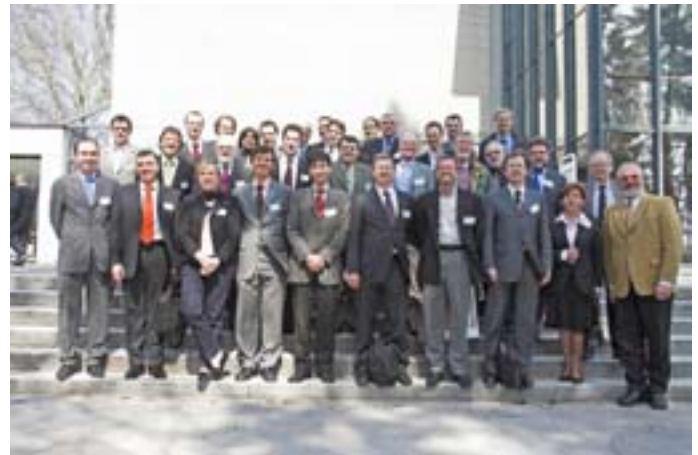
Delegates at the e-IRG workshop held on 10-11 April in Linz, Austria.